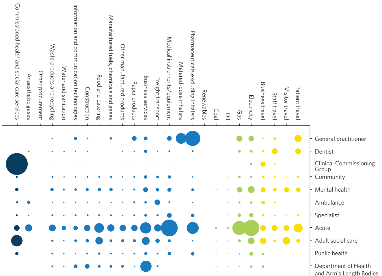
Fig. 1 Mental healthcare carbon emissions compared with other healthcare sectors. Relative carbon emissions of healthcare sectors (kgCO 2 e).

therapy and other web-based psychology programmes, are available for disorders such as depression, 42 anxiety 43 and insomnia. 44 These have as little as a fifth of the carbon emissions of face-to-face cognitive-behavioural therapy (230 kg v. 1100 kg), and a quarter of the carbon emissions of a course of antidepressant treatment with psychiatrist follow-up (900 kg). 45