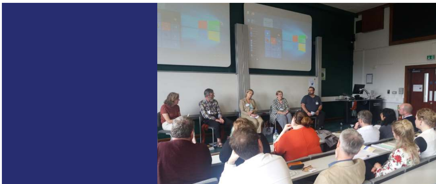
REFOCUS members at "Mind Reading - Mental Health and the Written Word, Birmingham University