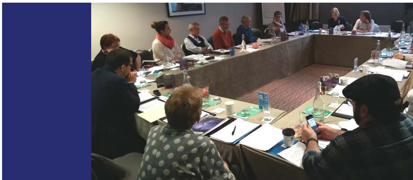
REFOCUS meeting, September 2018

“ One of the main achievements of our committee has been meeting many of the aims and objectives set out by the group and the recognition received from the College.. ”