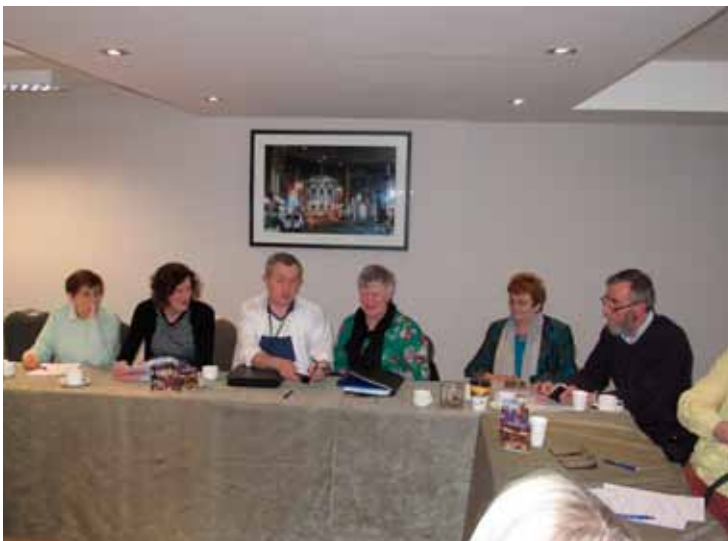
A REFOCUS meeting in action

in workshops and at various conferences. It appears that these presentations were well received although, being given to workshops, it meant that they “competed” with other presentations and did not reach as wide an audience as might have been wished. This is an issue the forum hopes to address in future. A full list of presentations is provided in Appendix 4.