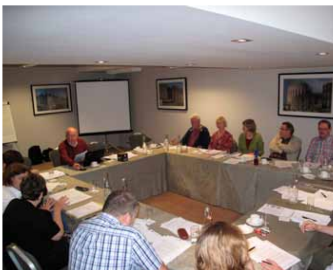
REFOCUS quarterly meeting in action

“I felt validated in my experience, when I met someone else who had been through something similar. It is so much easier to believe in yourself, if you can see someone else further down the road of recovery”