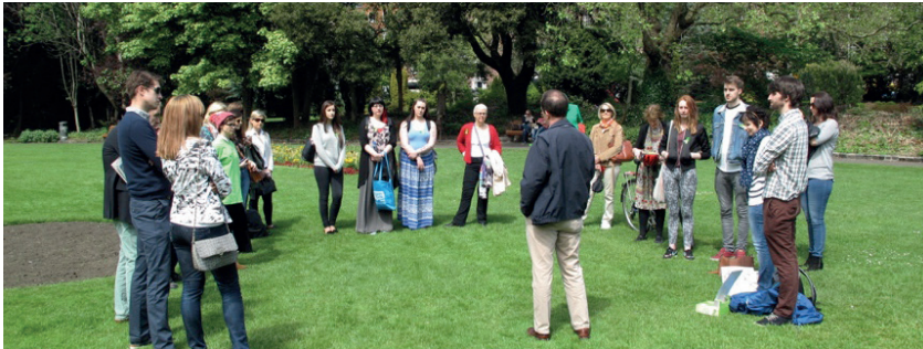
REFOCUS members at the 2016 Walk & Talk with See Change for Green Ribbon Month

Following its hugely successful launch in 2015, 2016 saw the second ‘Walk and Talk with Psychiatrists’ in partnership with See Change which involved a number of REFOCUS members. The event was attended by both medical professionals and the general public. The event received great media coverage particularly on thejournal.ie and joe.ie .