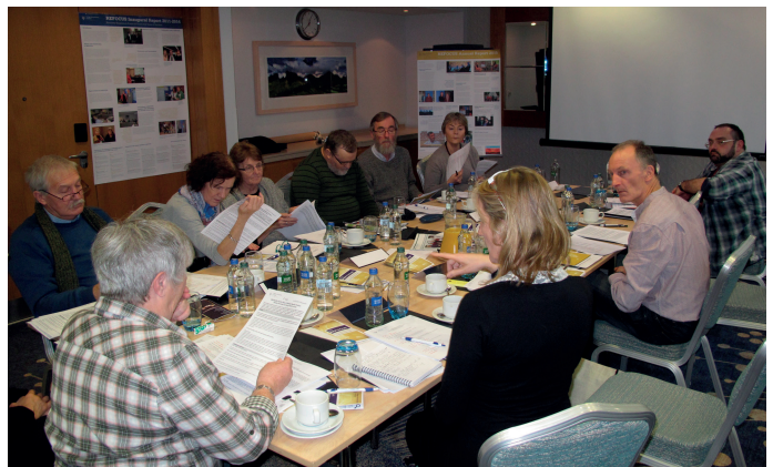
Refocus 4th quarterly meeting, December 2016

REFOCUS thank and acknowledge College Management Committee and Council for their continuing support for and belief in REFOCUS and their aims.